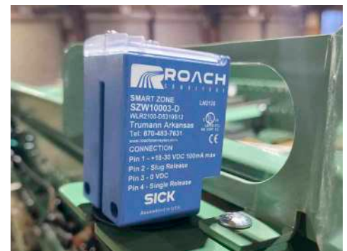
SMART ZONE PHOTO EYE

► DEFUSED SMARTZONE: Photoeyes mounted below tread rollers.